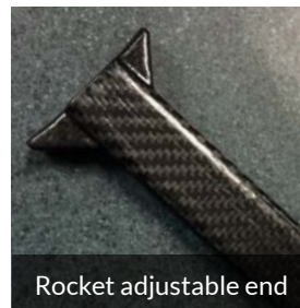
Rocket adjustable end